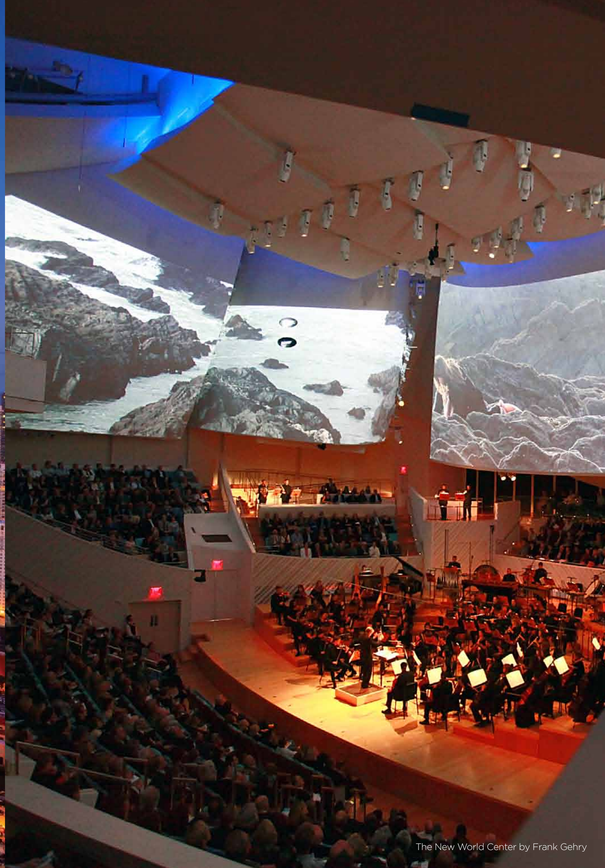
The New World Center by Frank Gehry