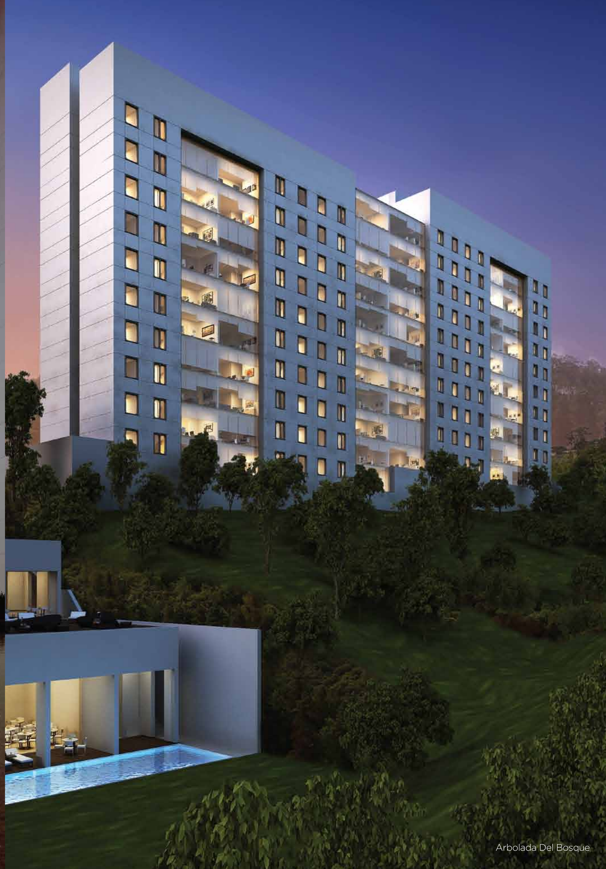
Arbolada Del Bosque