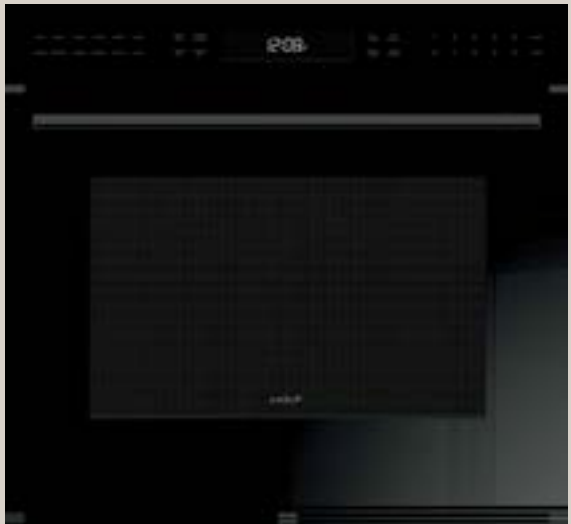
DUAL 30" WOLF CONVECTION OVENS Convection Oven with porcelain blue interior.