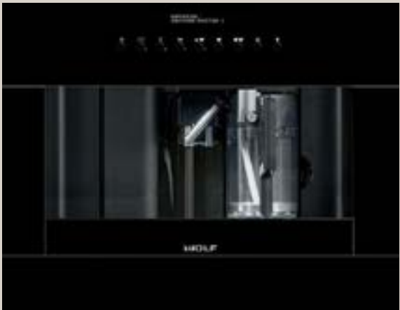
30" WOLF COFFEE SYSTEM Create perfectly brewed coffee, espresso, cappuccino, macchiato and latte at home.