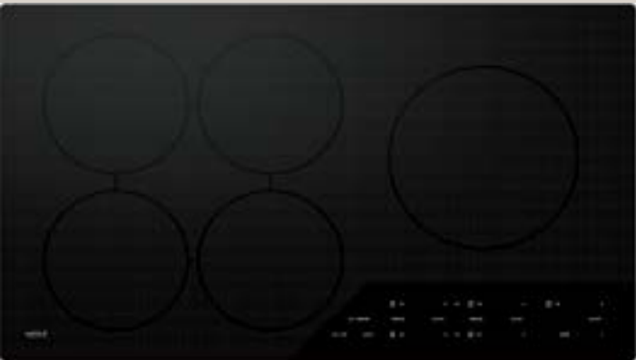
36" WOLF COOK TOP Induction Stove.