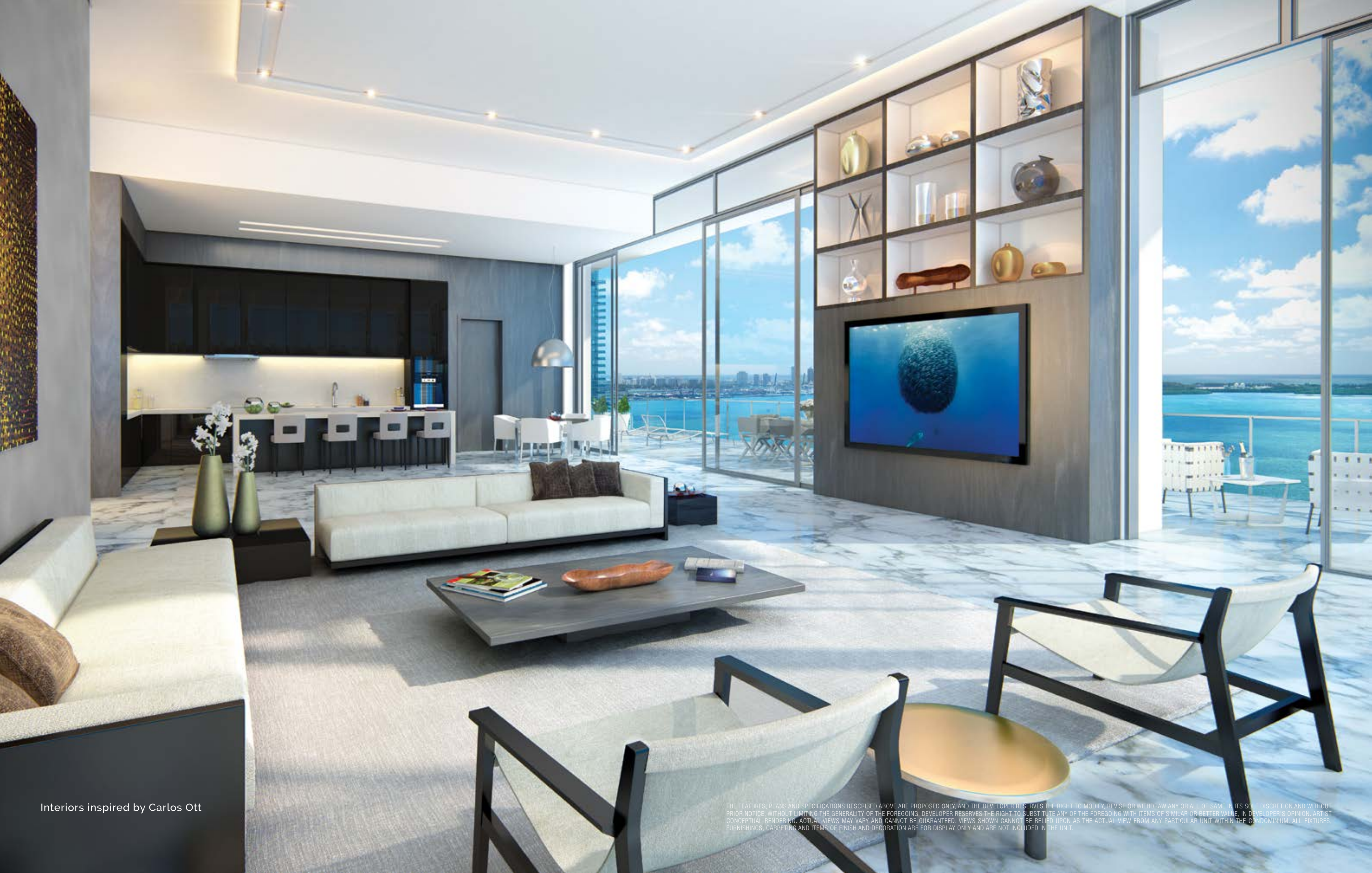
Interiors inspired by Carlos Ott

THE FEATURES, PLANS AND SPECIFICATIONS DESCRIBED ABOVE ARE PROPOSED ONLY, AND THE DEVELOPER RESERVES THE RIGHT TO MODIFY, REVISE OR WITHDRAW ANY OR ALL OF SAME IN ITS SOLE DISCRETION AND WITHOUT PRIOR NOTICE. WITHOUT LIMITING THE GENERALITY OF THE FOREGOING, DEVELOPER RESERVES THE RIGHT TO SUBSTITUTE ANY OF THE FOREGOING WITH ITEMS OF SIMILAR OR BETTER VALUE, IN DEVELOPER'S OPINION. ARTIST CONCEPTUAL RENDERING. ACTUAL VIEWS MAY VARY AND CANNOT BE GUARANTEED. VIEWS SHOWN CANNOT BE RELIED UPON AS THE ACTUAL VIEW FROM ANY PARTICULAR UNIT WITHIN THE CONDOMINIUM. ALL FIXTURES, FURNISHINGS, CARPETING AND ITEMS OF FINISH AND DECORATION ARE FOR DISPLAY ONLY AND ARE NOT INCLUDED IN THE UNIT.