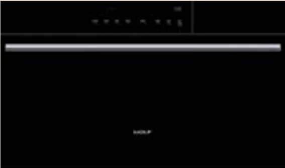
30" WOLF CONVECTION STEAM OVEN Take advantage of the most innovative steam oven on the market today. Virtually any dish prepared in a microwave, conventional oven, or range can also be prepared in the Wolf convection steam oven - with more control.