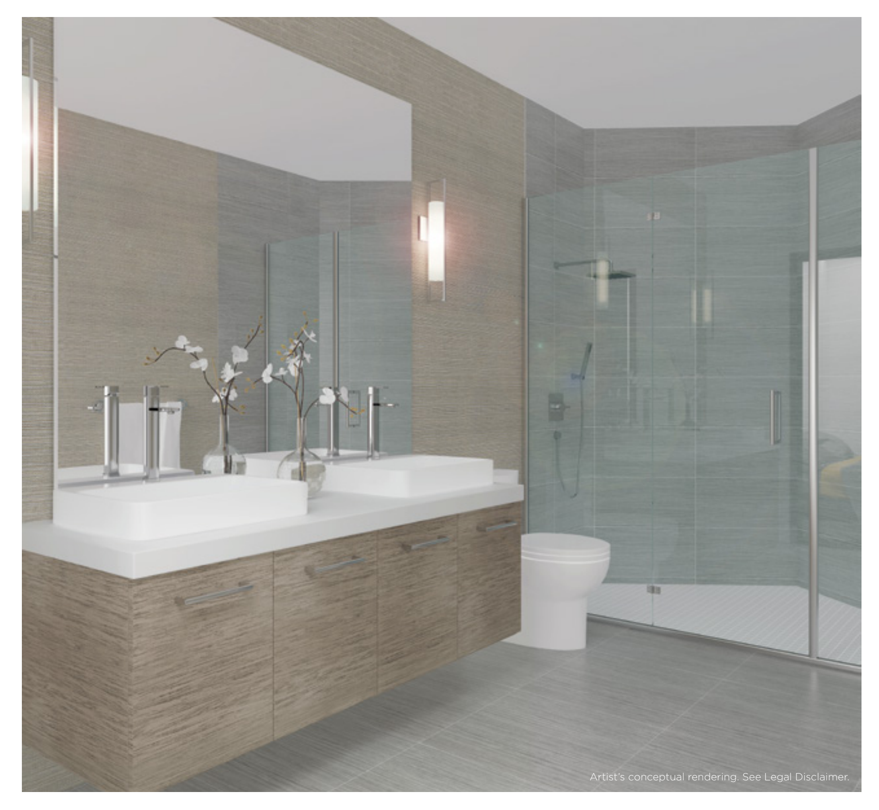
ITALIAN DESIGNED BATHROOMS FINISHED WITH PORCELAIN TILE