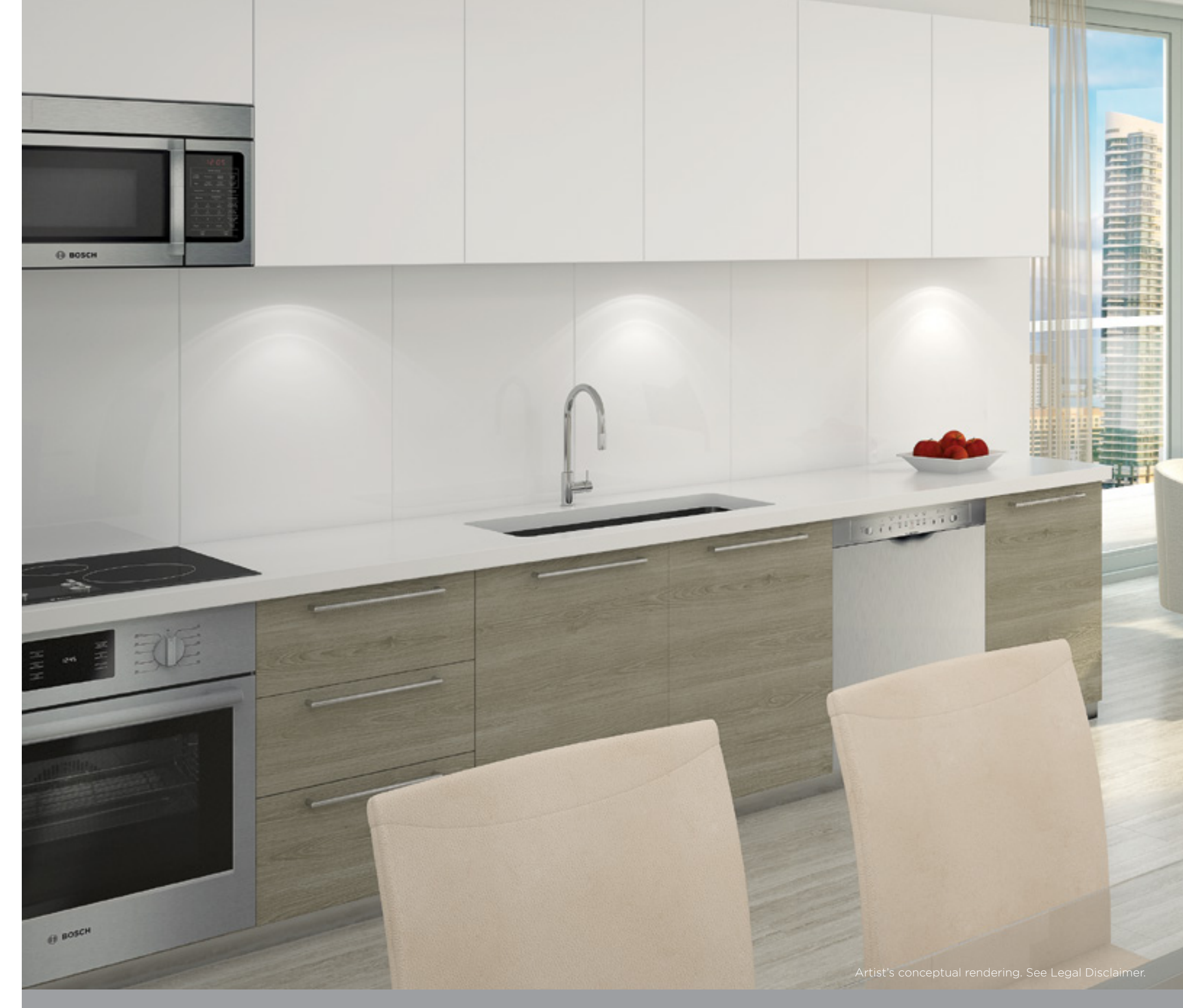
ITALIAN KITCHEN CABINETRY WITH BOSCH STAINLESS STEEL APPLIANCES